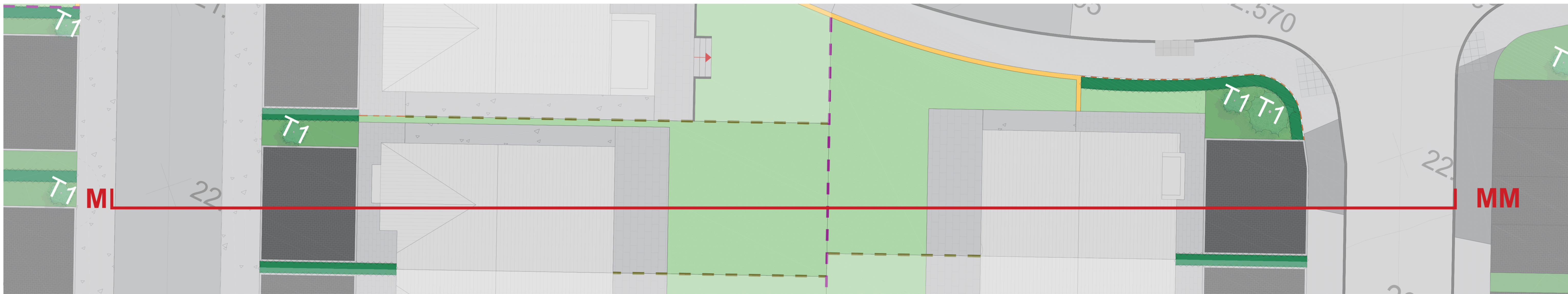
TYPICAL GARDEN PLAN 1 SCALE: 1:100/A1

DO NOT SCALE FROM THIS DRAWING. WORK ONLY FROM FIGURED DIMENSIONS ALL ERRORS AND OMISSIONS ARE TO BE REPORTED TO LANDSCAPE ARCHITECT