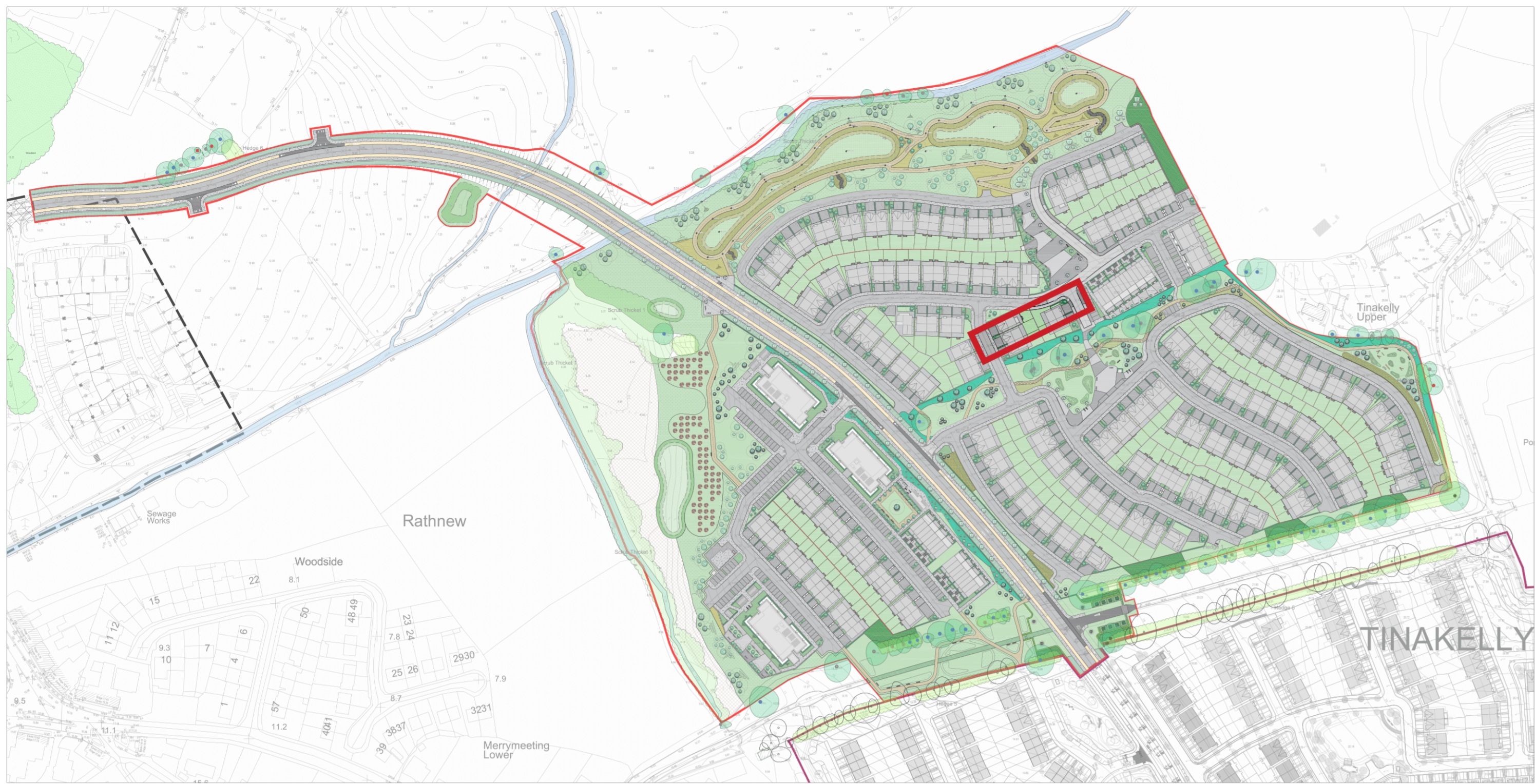
INDICATION PLAN SCALE: 1:2500/A1